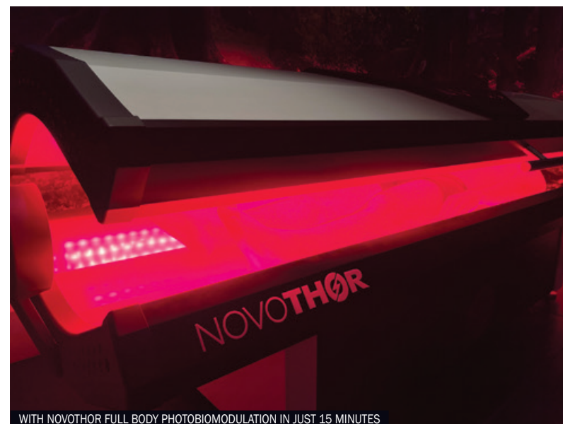
WITH NOVOTHOR FULL BODY PHOTOBIO-MODULATION IN JUST 15 MINUTES

The NovoTHOR bed is a whole-body red-light therapy using 660 nm visible red and 850 nm near-infrared light to treat injuries, increase blood circulation, reduce pain, relax muscles/joints, and improve energy levels. "It's the top of the line for relaxation and stress reduction. Even the US Special Forces use NovoTHOR@."